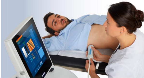
Figure 1: Patient receiving a liver assessment using the FibroScan machine